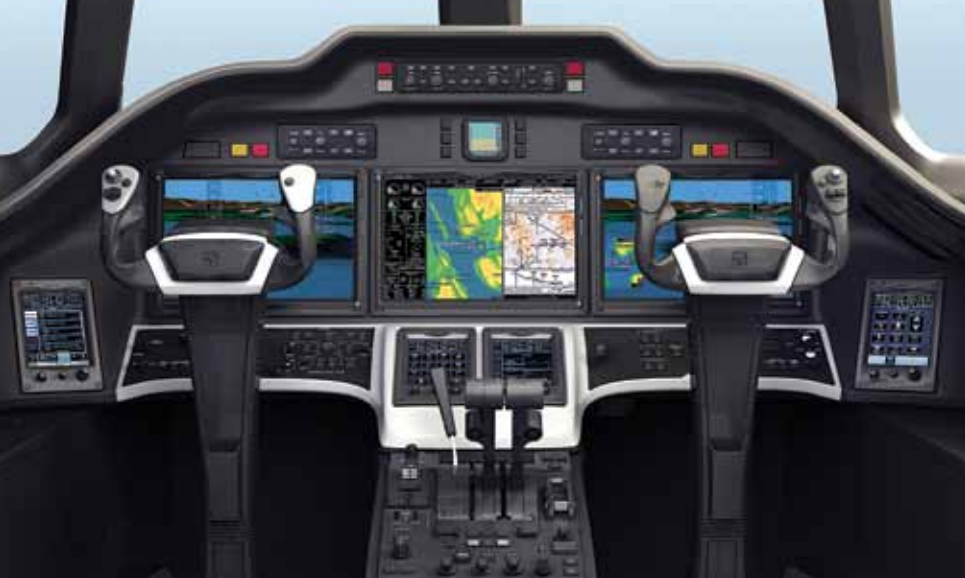
The Ten is the first announced launch customer for Garmin's G5000.

with the throttles full forward, though, will approach 3,000 pph under those conditions, approaching the nautical miles per pound thirst of a heavy-iron jet.