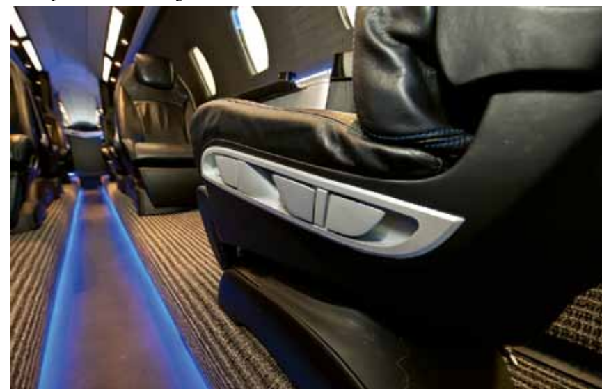
New seats have retractable arm rests. Multi-color accent lights provide contrast to dark and light motif.

On the right side, there is a galley with increased storage space, both above and below the counter, for beverages, food and tableware. It appears that the galley now spans across the right front window