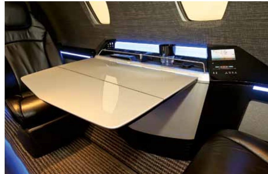
Longer cabin makes room for larger work tables and more legroom. Each seat has a built-in touch screen.

The side rail ledges, outboard of the folding worktables, have been completely redesigned with rail-fenced shelves that can hold PDAs, cell phones, glassware and personal items. Each end of the shelf has two powered USB ports for recharging and data connections, plus a headphone jack. Standard AC power outlets for laptops and other office equipment will be mounted low in the sidewalls. Overhead,