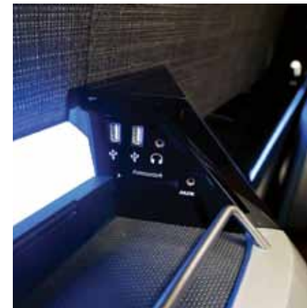
Rail-fenced shelves, outboard of the work tables, are brightly illuminated. End caps have USB, audio and aux data ports.

At the back of the cabin, there is a full-width lavatory with an externally serviced toilet. Some Citation X operators have remarked that its 5-gal. tank is a little short on capacity for long missions. Cessna looked at replacing the current system with a vacuum lav, but the current production components are too bulky for this class of aircraft.