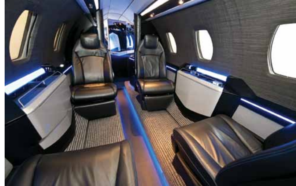
Techno-futuristic interior mock-up eschew British midsize traditions in favor of chris dark and light contrasts, metal and composite surfaces, and multi-color accent lights.

Outside of the engine upgrade, adding winglets to the Ten is the other main change. They reduce drag by about 3% to 6% in high-altitude cruise, according to Bob Kiser, president of Wichita-based Winglet Technology, the firm that partnered with Cessna to develop the modification. Kiser also noted that the winglets considerably reduce induced drag during takeoff and landing, having a favorable impact on V speeds, runway